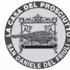
Alberti "La Casa del prosciutto"